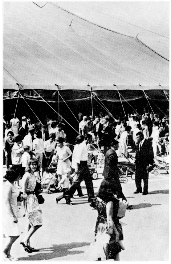
Services Are Over! The Exodus.