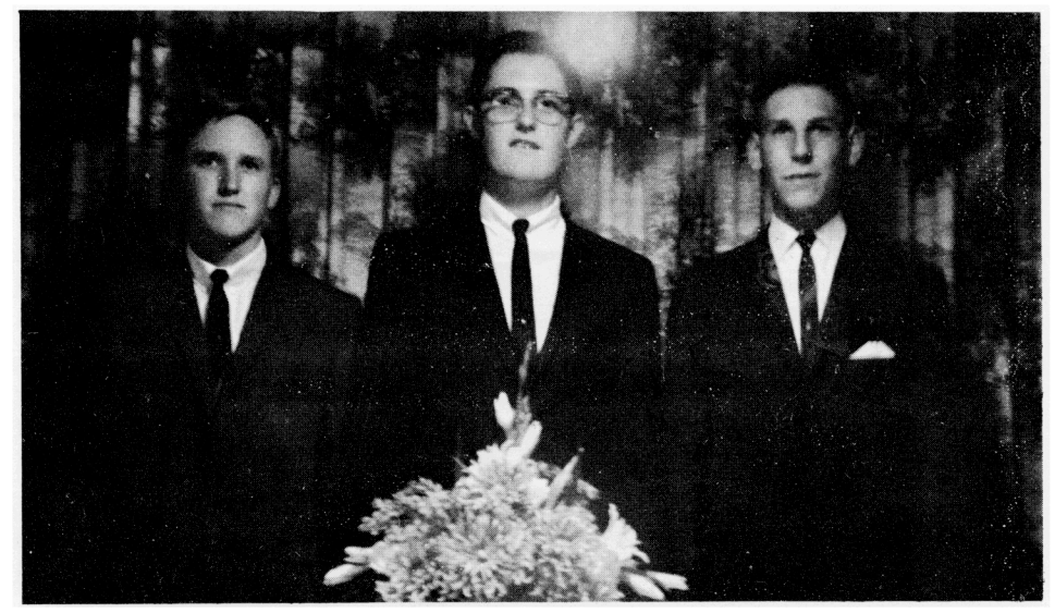
Odessa's Ambassador College Freshmen