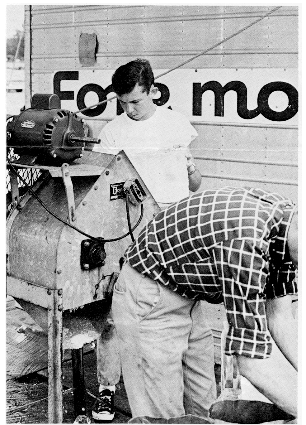
Ambassador students provided numerous services for the people attending the Feast. Here one of the freshmen grinds a block of ice for another customer.

Brethren from all over exuberantly participated in all types of activities ranging from basketball and softball events to eligibles picnics and ice cream parties. But there had to come an end to the festivities and 8,000 campers broke camp while thousands more packed-up at motels for the long journies home.