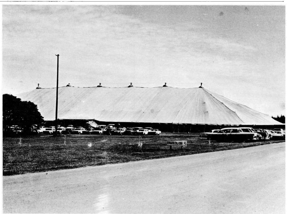
The Huge Canvas Tabernacle