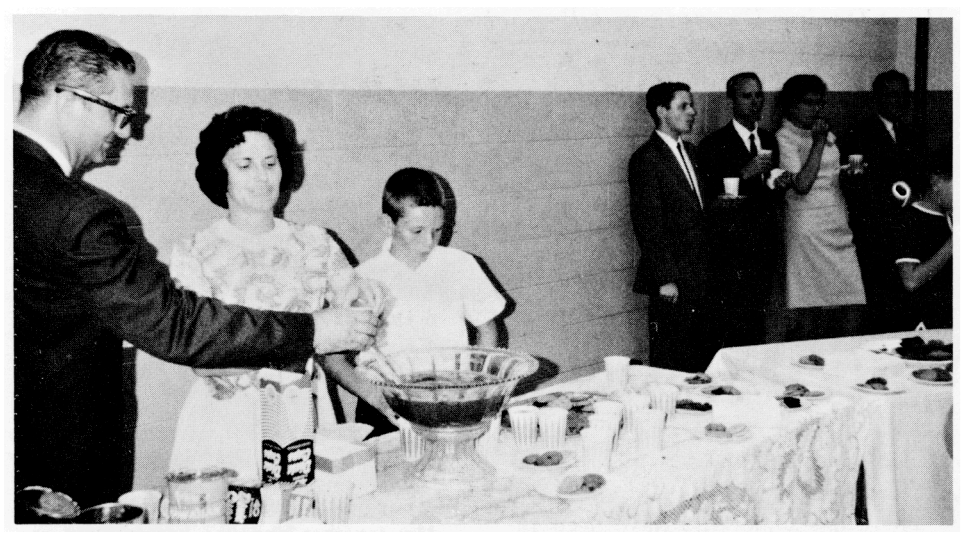
"Anyone for Seconds on the Punch?"