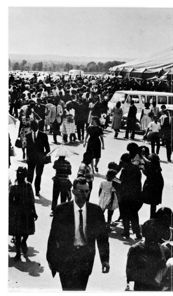
Throngs leave the tent after morning service