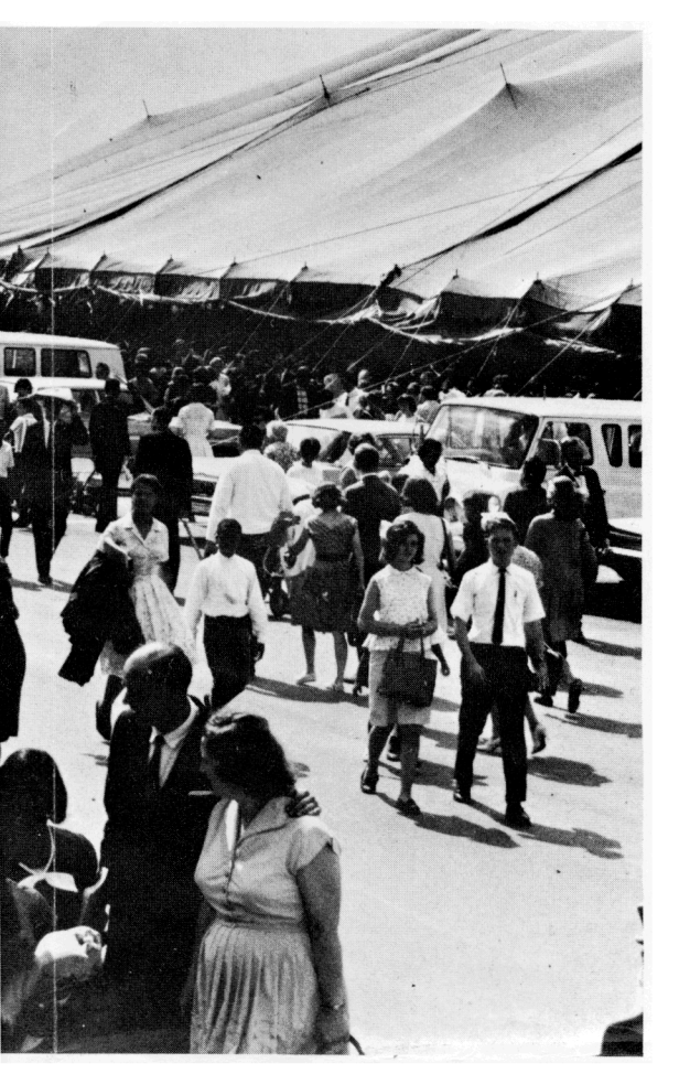
ervice and head for their "smaller" tents for lunch.